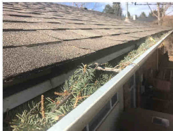
Winter winds can add a surprising amount of debris to the gutters.